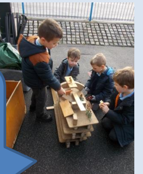
We are so imaginative! We are really good at building.

We love to write letters, lists and labels!